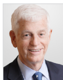
MARIO J. GABELLI, CFA Chief Executive Officer GAMCO Investors, Inc.